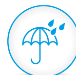
IP44 - IP66 Weather Proof