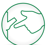
Multiple Switchgear Arrangements