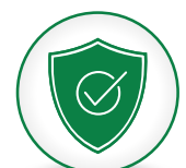
Strong & Durable