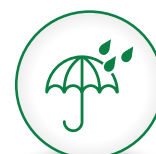
IP44 - IP66 Weather Proof