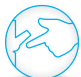
Multiple Switchgear Arrangements